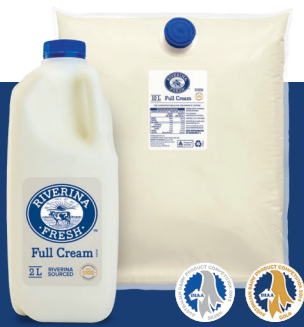
Full Cream Milk*